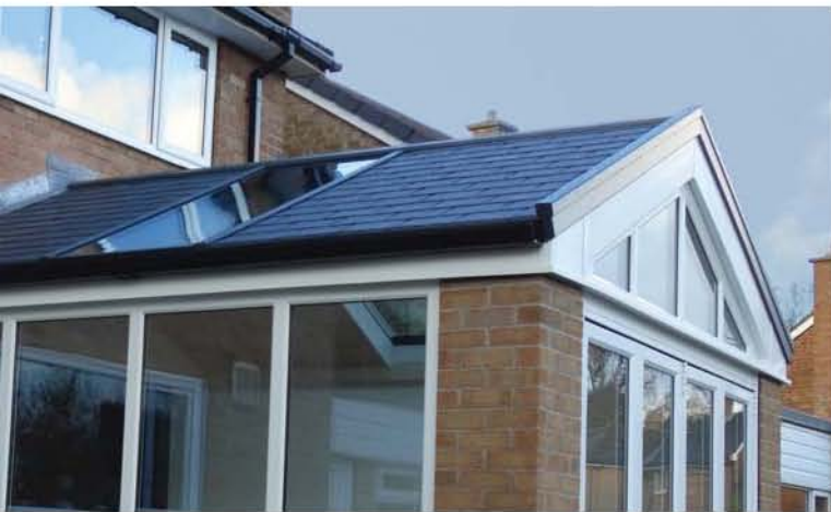
UltraRoof380 allows the installation of full height rectangular glass panels

A lightweight tiled roofing system that creates a beautiful vaulted plastered ceiling inside.