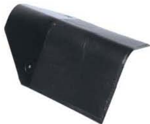
UltraTile ridge and hip capping - optional upgrade

Choose from three colours for your authentic tile finish