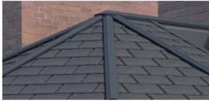
Powder coated aluminium ridge and hip capping is standard