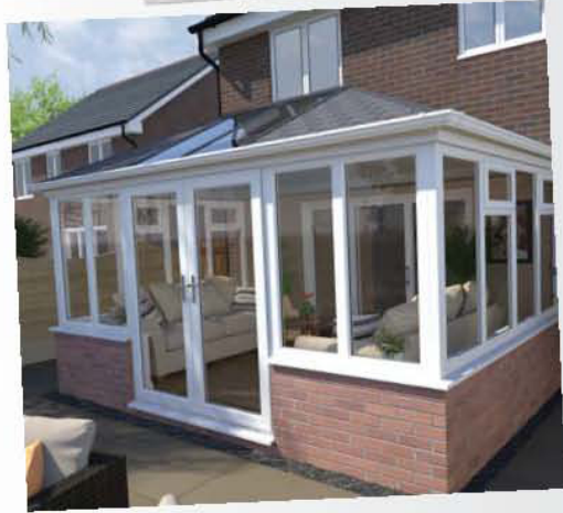
UltraRoof380 is available in 3 authentic slate finishes.

The difference in loading on the foundations is negligible. Provided there is no sign of settlement in the base there is no need to 'boost' the foundations. Please consult your retailer if in any doubt.