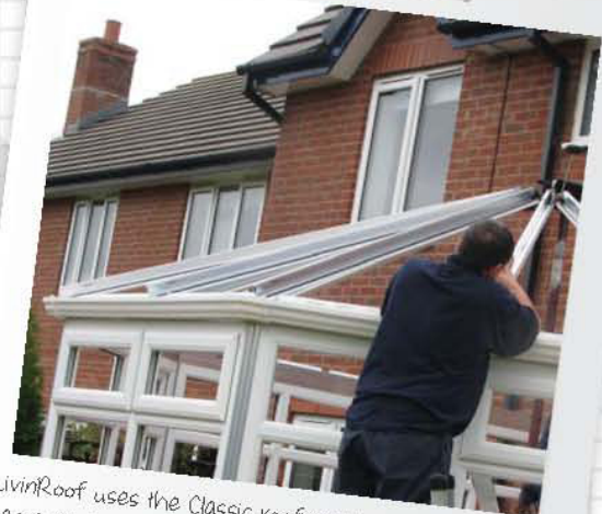
LivinRoof uses the Classic roof system so fitters can swap an old for a new one very quickly

A. As the roof complies with Building Regulations, it is as thermally insulated as possible, in fact LivinRoof and UltraRoof380 is up to 15 times more thermally efficient than the roof it replaces. Offering greater comfort and lower bills than you have been used to. You can also keep the light too with both LivinRoof and UltraRoof380.